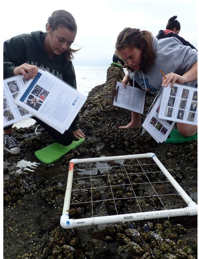
FIGURE 3 Students working in the rocky inter-tidal with the Long-term Monitoring Program and Experiential Training for Students (LiMPETS) program

LiMPETS is an environmental monitoring and education program primarily focused on 7th–12th grade students (ages 13–18) (Figure 3). This hands-on program was launched in 2004 in and around California's National Marine Sanctuaries as a way to increase awareness and stewardship of these important areas, with now approximately 5,000 students participating annually at 68 sites state-wide. Participants engage in monitoring activities, gain experience using the tools and methods employed by field scientists, and can enter their data online. The program focuses on two inter-tidal habitat types: rocky shore (27 sites) and sandy beach (41 sites). The rocky inter-tidal program collects count and presence/absence data on a list of 34 categories scored in 0.25 m 2 quadrats (either random or fixed along a