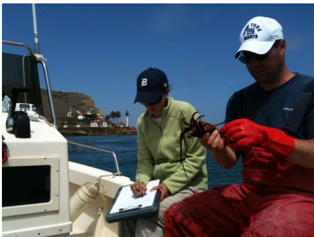
FIGURE 1 Members of the Southern California Lobster Research Group collect data on California spiny lobsters

There were two key reasons for structuring the research in this collaborative framework. First, it allowed implementation of a variety of monitoring tools. Building a strong team of researchers from academia, management and industry, with different expertise, enabled a focus on several different components of monitoring (e.g., boat-based